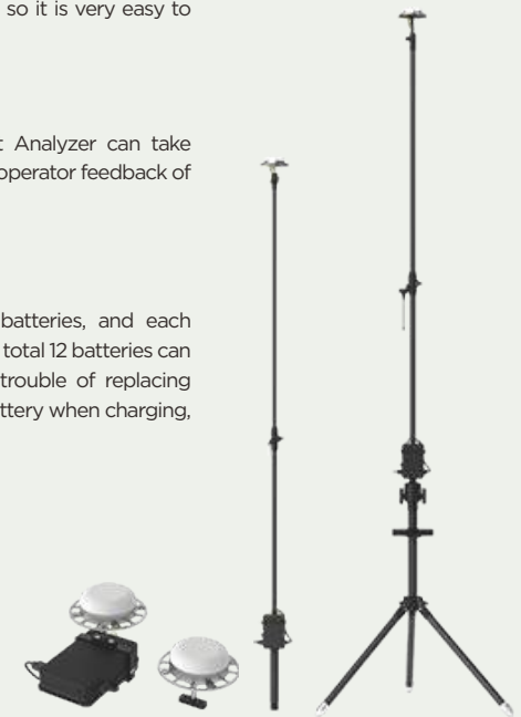
High-precision RTK System