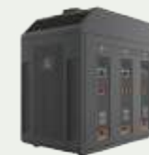
Battery Charging Hub

A specially designed Charging Hub connects up to 6 batteries, and each intelligent balancing charger can connect 2 charging hubs. In total 12 batteries can be connected and charged in sequence, saving you the trouble of replacing batteries for charging. It can balance the voltages of each battery when charging, allowing longer battery life.